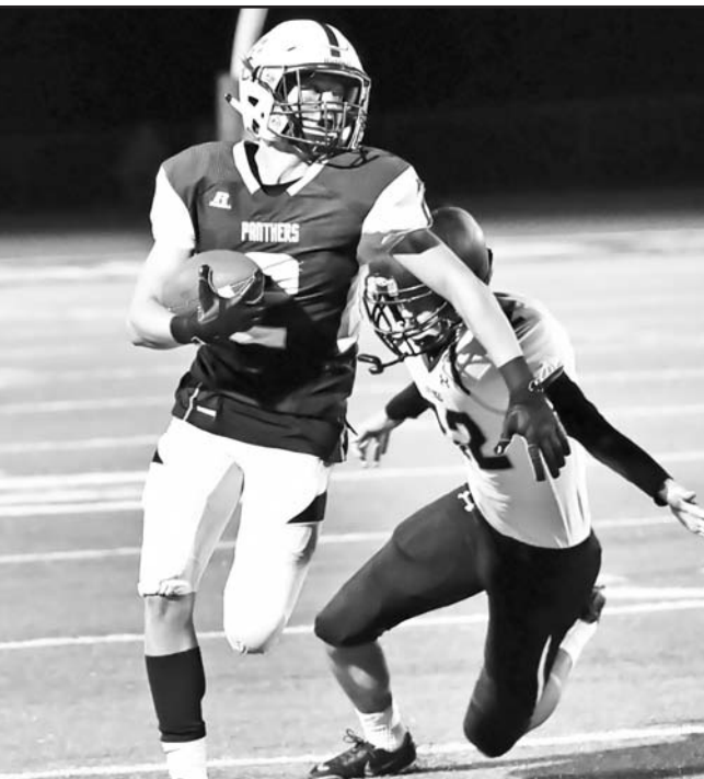
touchdown.